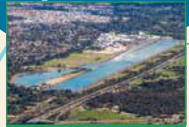
WRIGHT LAKE 2.2KM